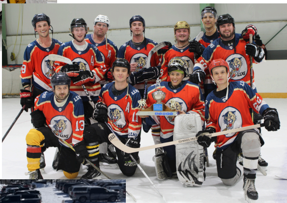
Men's Competitive Champs- Kings