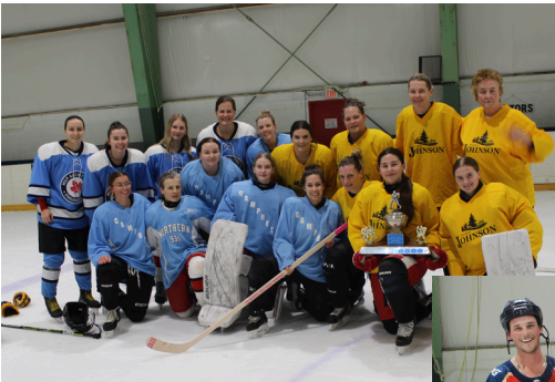
Women's Division Champs- Karhis